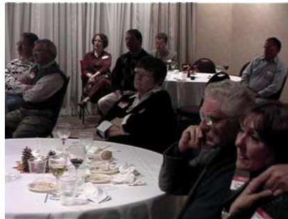
Docents and guests