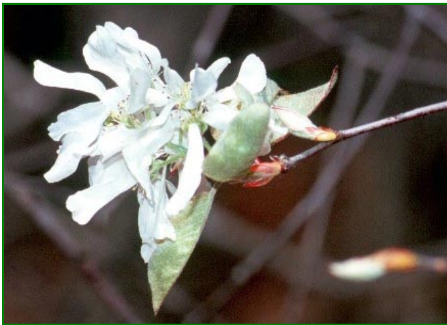
Serviceberry at J. T. Nickel Preserve