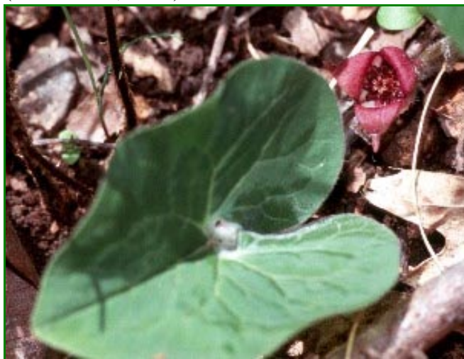
Wild Ginger at J. T. Nickel Preserve

support NEON research projects and educational activities. Data from standard measurements made using NEON will be publicly available.’ (NSF 04549, 2004).”