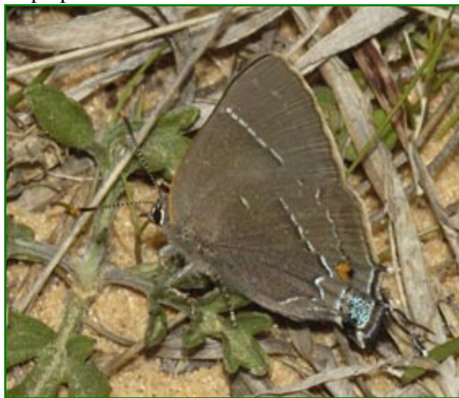
White M Hairstreak, Parrhasius m-album Keystone Ancient Forest Preserve