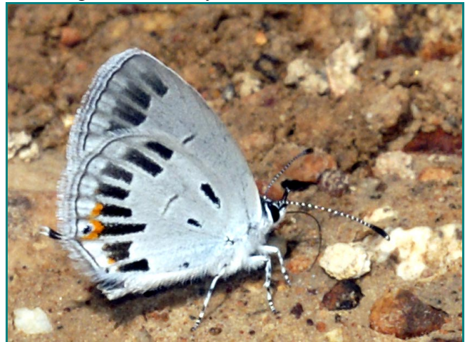
Eastern Tailed-Blue, Everes comyntas J.T. Nickel Preserve, Apr 8, 2005