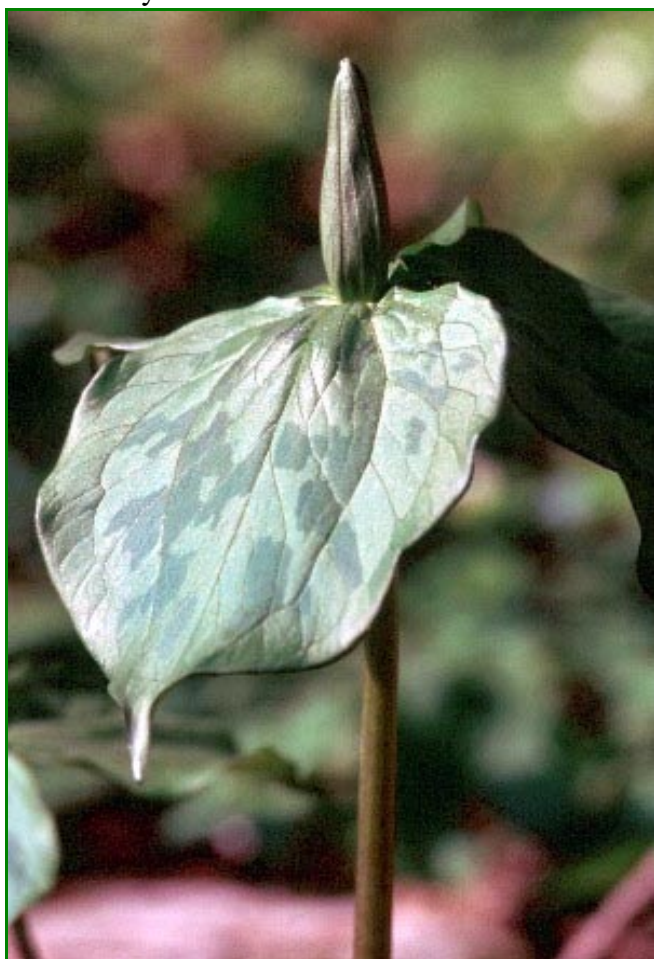
Trillium at J. T. Nickel Preserve