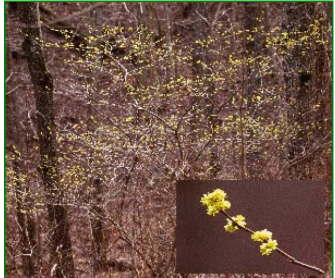
Spicebush SM at J. T. Nickel Preserve

You can order a copy of this book from your favorite bookseller. Tulsa library has three copies in the library system available for lending; go on-line and have a copy delivered to a branch library near you at www.tulsalibrary.org .