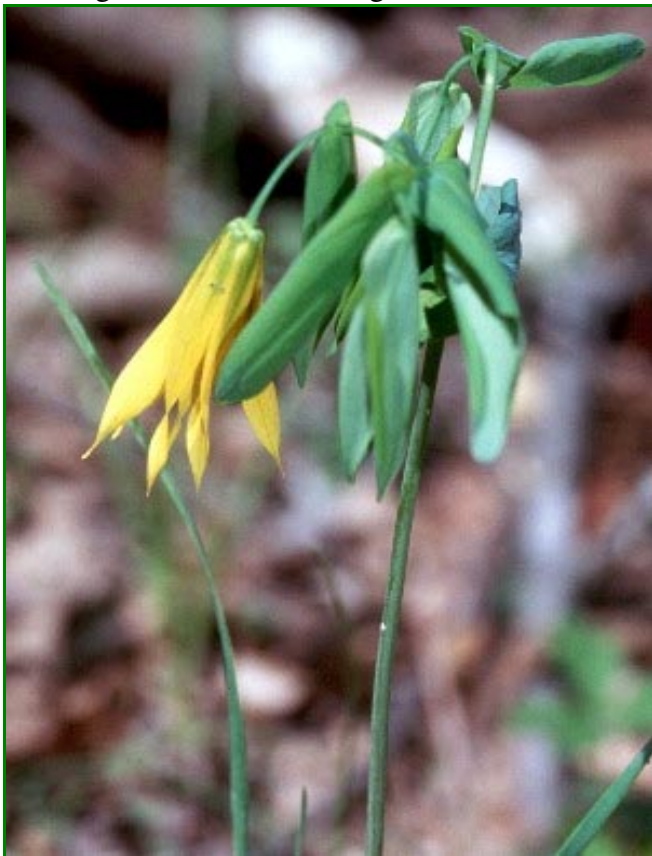
Bellwort at J. T. Nickel Preserve