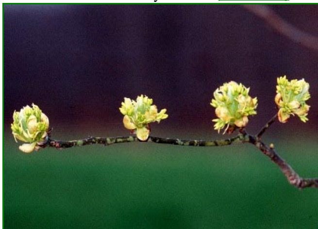
Sassafras at J. T. Nickel Preserve