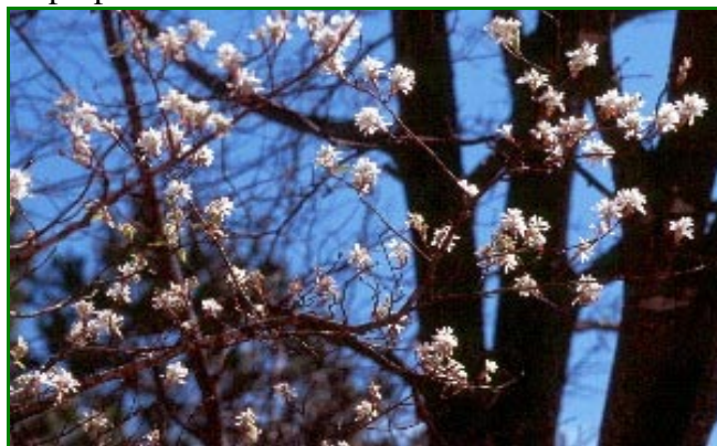
Serviceberry at J. T. Nickel Preserve